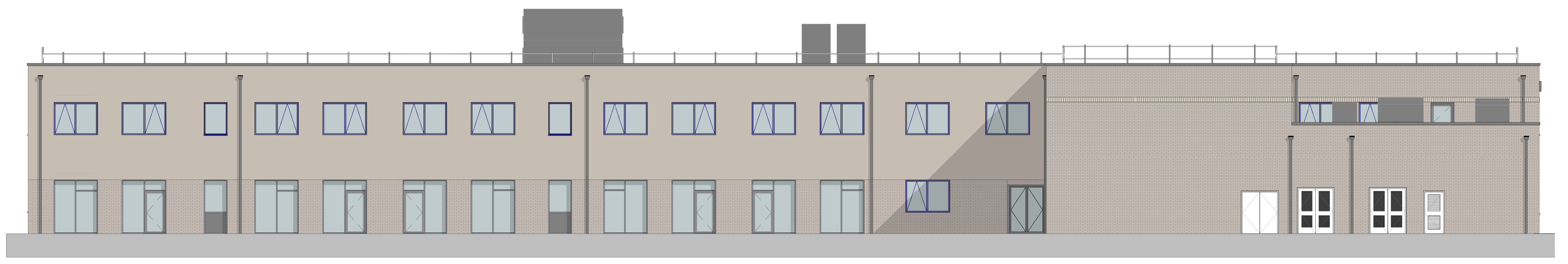
2 | South Elevation 1 : 100