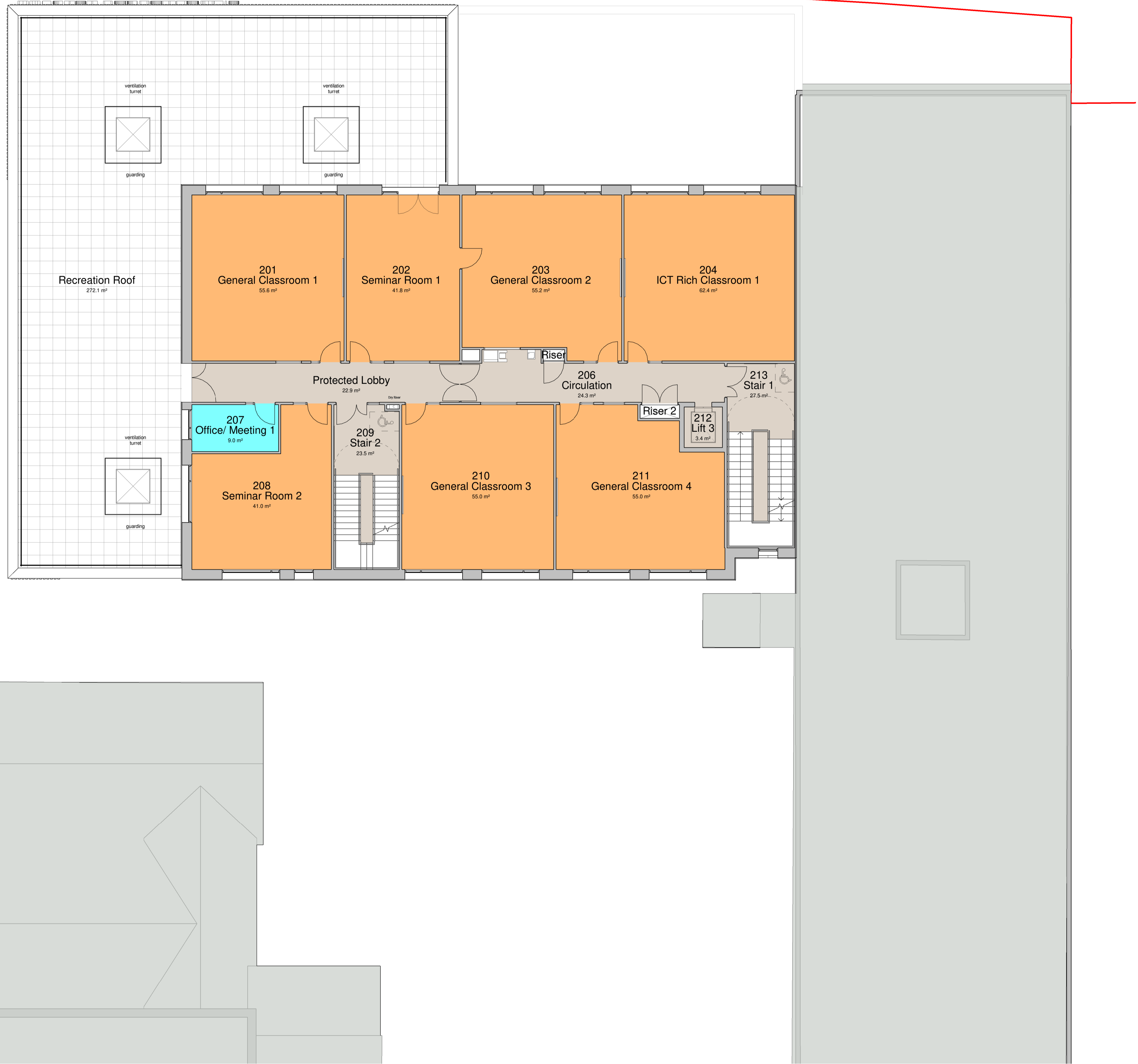
Proposed Second Floor Plan 1 : 100

P01 15.09.20 CY Planning Public Consultation issue AC